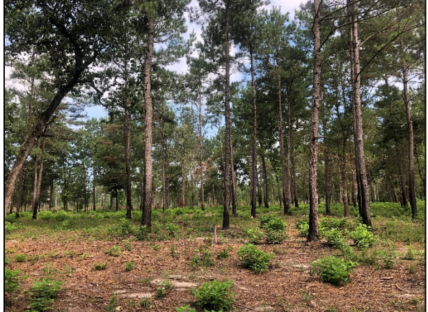
Loblolly pine stand burned following thinning, Montgomery County, 18 acres