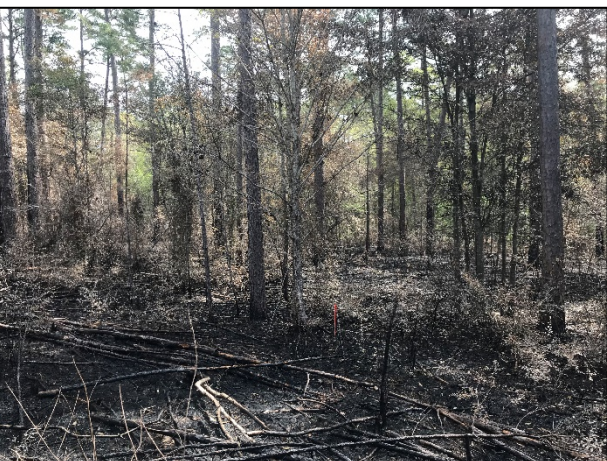
Mature longleaf pine stand, Nacogdoches County, 108 acres