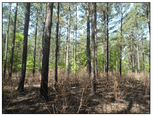
Mid-rotation loblolly pine plantation, Houston County, 800 acres